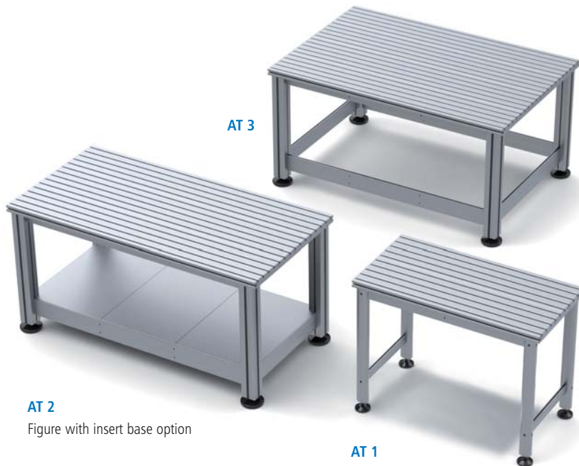
AT 2 Figure with insert base option

Insert base for AT 3 Part no.: 248551 0013