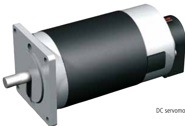
DC servomotor DC 100