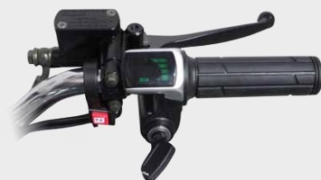
Key switch, forward / reverse function key and charging status