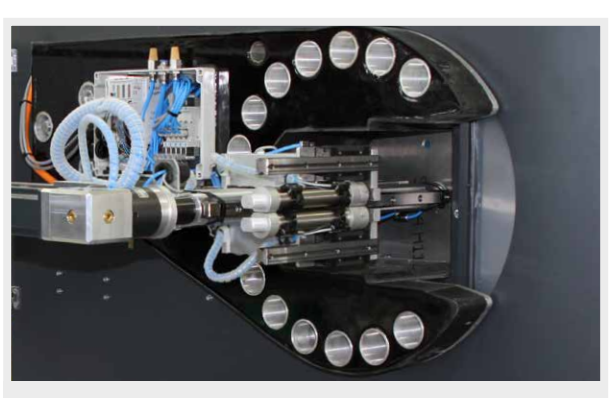
Tool changer with external lateral position