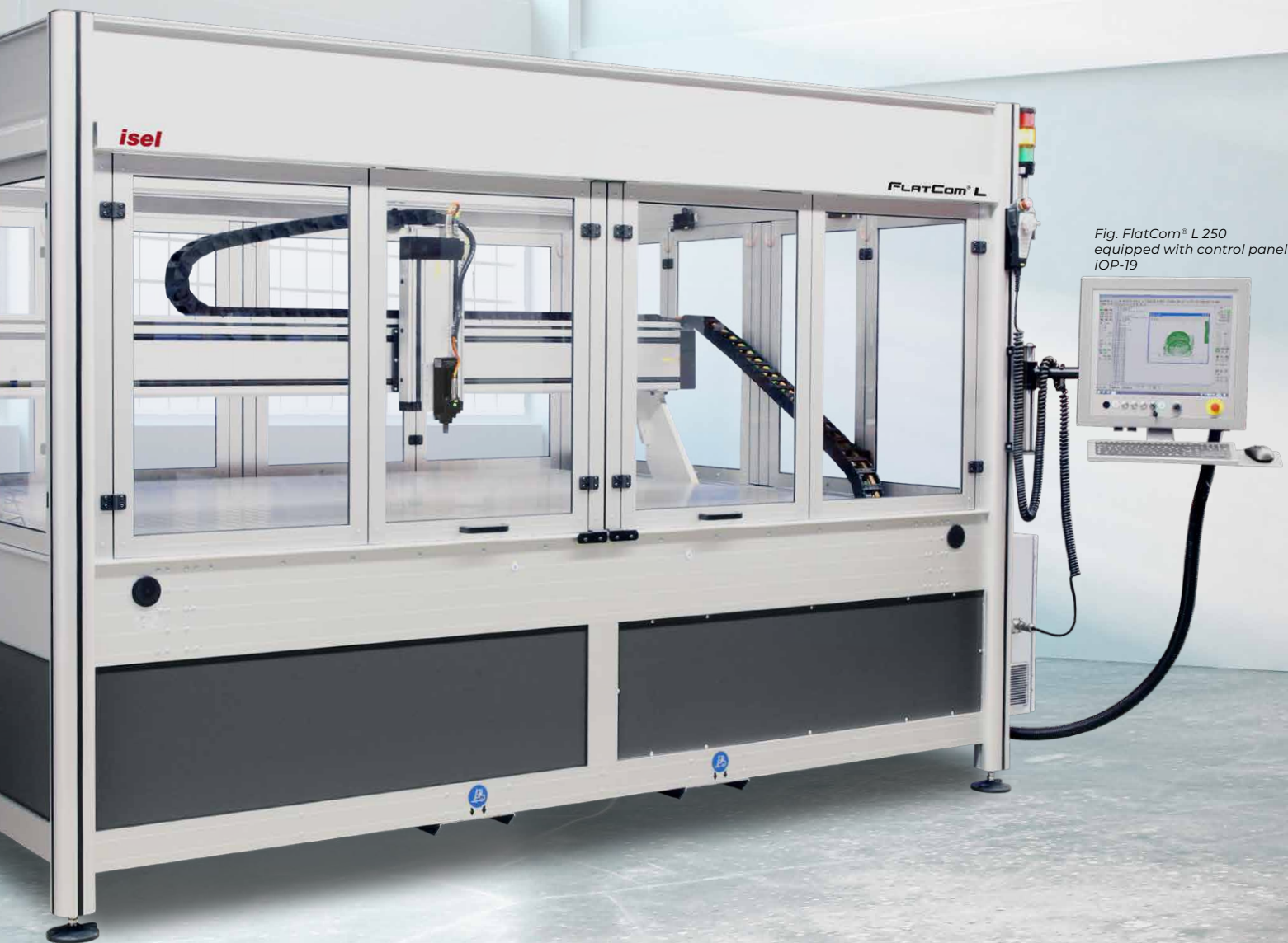
Fig. FlatCom® L 250 equipped with control panel iOP-19